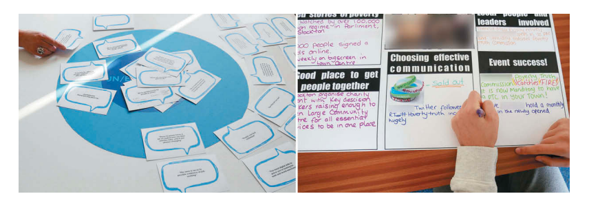
Figure 1. Workshop 2 mapping guotes and envisioning exercise with newspaper template.