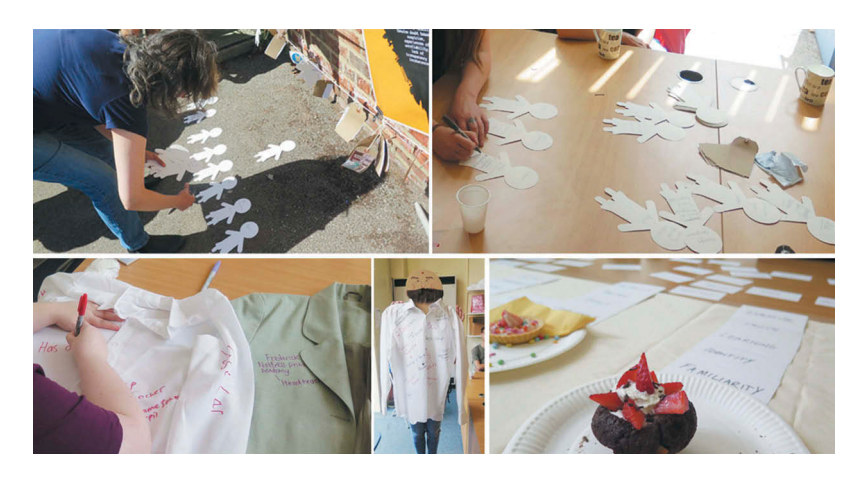
Figure 2. Workshop 3 mapping potential partners, costume annotation, role play and cake making.

To extend this discussion we also used food to encourage the group to reflect on its potential vital role in facilitating enjoyable ways of sharing time together with the potential to break down more formal or hierarchical barriers. In responding to the significance of collective food sharing in previous sessions (i.e. a good lunch was always provided and appreciated by volunteers) we then created cakes as imagined gifts for the influential people the group were interested in engaging with. Using single words written on postcards to articulate different facets or 'ingredients' of trust next to the cakes, we used these to prompt further discussion on what participants felt were