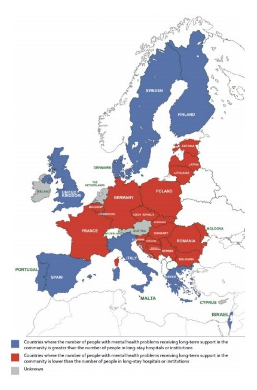
Map 1. Long-term care in institutions vs. community care in the field of mental health care in Europe.

ing and interpretation of Article 19, and the first wave of deinstitutionalisation has been implemented based on these varying concepts.