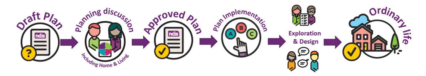
Figure 2. Home and Living funding process for participants

ordinary life is working for you. At this check-in meeting you can also discuss how you could use your budget flexibly to meet different support needs or discuss if your circumstances have changed and you plan needs to be reassessed.