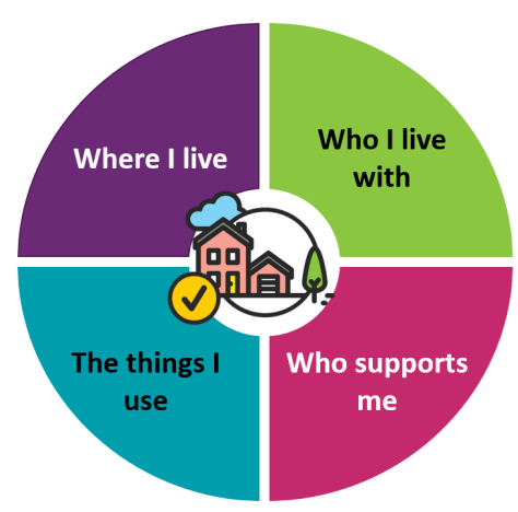
Figure 1: Home and Living Discussion Themes