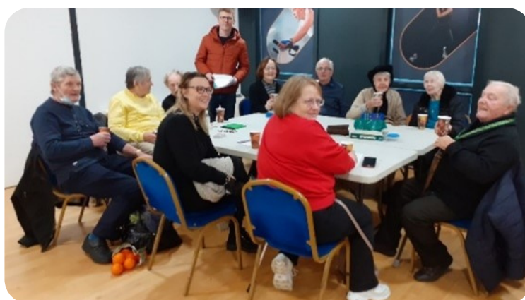
East Anglia Focus Group